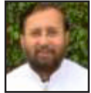
Sh. Prakash Javdekar Minister of Environment