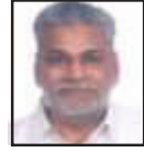
Sh. Parsottambhai Rupala Union Minister of F&AHD