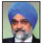
Dr. Montek Singh Ahluwalia Hon'ble Dy Chairman, NITI Ayog