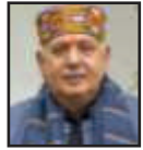
Sh. Surya Pratap Shahi Agriculture Minister, UP