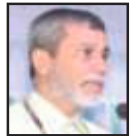
Sh. Siraj Hussain Secretary - MFPI Government of India